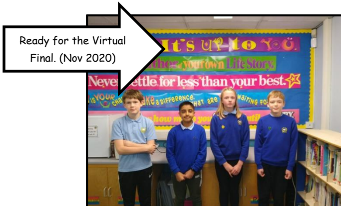
Ready for the Virtual Final. (Nov 2020)

Please see below for a couple of extracts from a fantastic personal piece of writing that one of the Euroquiz Team members wrote, reflecting back on their experiences: