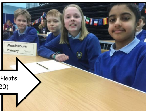
EDC Euroquiz Heats (March 2020)